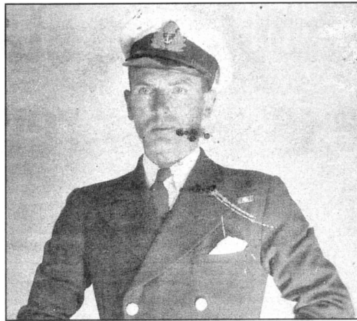
A damaged, unpublished portrait taken in Christmas 1942. CNF

UNPUBLISHED photographs of a Shepshed war hero were uncovered by a Loughborough man while on holiday in Malta.