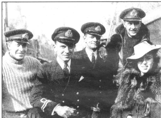
An unpublished wedding photo taken before June 13, 1941. CNF