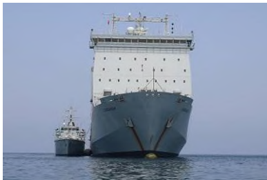
Rafting with the towering RFA CARDIGAN BAY.