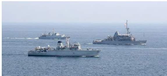
CHIDDINGFOLD (foreground), USS GLADIATOR (middle) and PENZANCE (background).

CHIDDINGFOLD sailed to the Gulf of Oman along with other specialist MCMVs, our sister ship PENZANCE and USS GLADIATOR in order to test their core skills against exercise mine shapes. During this period, we worked with other warships and air assets and had to protect the larger ships such as HMS DEFENDER and lead her through an area of mined water.